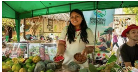
Peru: Nearly two decades of work in the Amazon rainforest has created a healthy agricultural marketplace, local & global, that is protecting both the indigenous people and the land where they live.

Our commitment is unwavering: to create a world where economic progress does not come at the cost of human dignity and a healthy environment.