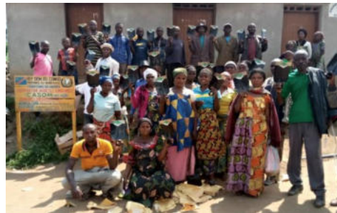
Democratic Republic of the Congo: Building off the experience in the Amazon, Not For Sale funded five co-ops in the Great Lakes region of East Africa. Pictured here are members of the CODEL UMOJA WETU co-op in Eastern DRC.