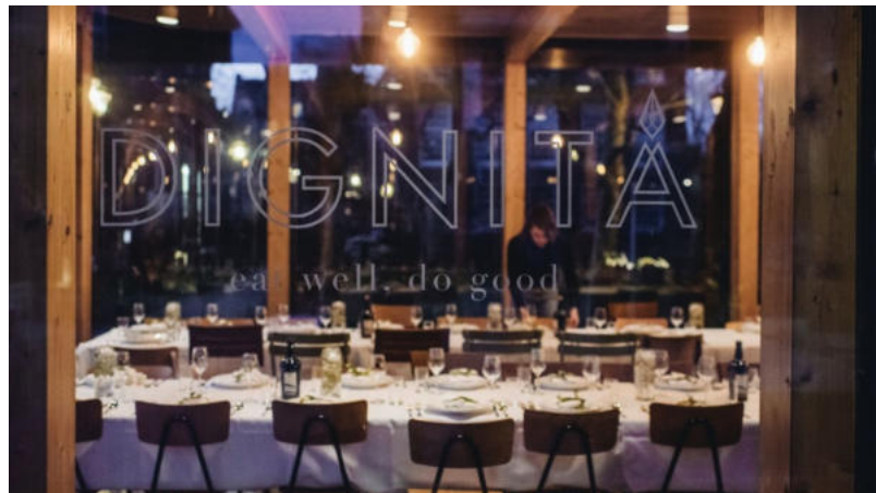
Dignita: Our Netherlands-based social enterprise, providing jobs, training, and all-around social support. Learn More .

In each country, we it is our goal to conduct research and development to create a self-sustaining enterprises that supports our direct service work.