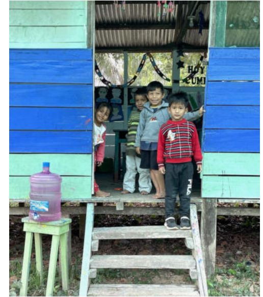
Children at one of the school's Not For Sale helped fund near Madre de Dios, Amazon, Peru.

Additionally, we helped start REBBL, a beverage company that sources ingredients from at-risk communities such as AFIMAD. Today, REBBL has generated over $2 million for Not For Sale's projects around the world, including our extensive support of our indigenous partners in the Peruvian Amazon outlined above. REBBL's DNA as a company courses through the Amazon rainforest ( watch the documentary ).