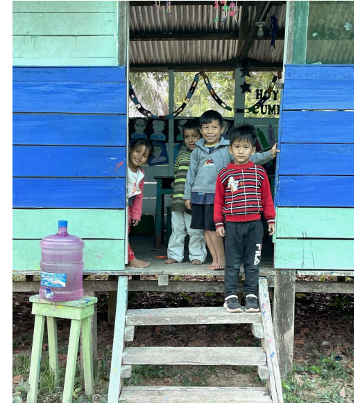
Children at one of the school's Not For Sale helped fund near Madre de Dios, Amazon, Peru.

Additionally, we helped start REBBL, a beverage company that sources ingredients from at-risk communities such as AFIMAD. Today, REBBL has generated over $2 million for Not For Sale's projects around the world, including our extensive support of our indigenous partners in the Peruvian Amazon outlined above. REBBL's DNA as a company courses through the Amazon rainforest ( watch the documentary ).