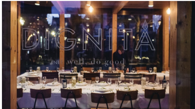
Dignita: Our Netherlands-based social enterprise, providing jobs, training, and all-around social support. Learn More .

In each country, we it is our goal to conduct research and development to create a self-sustaining enterprises that supports our direct service work.